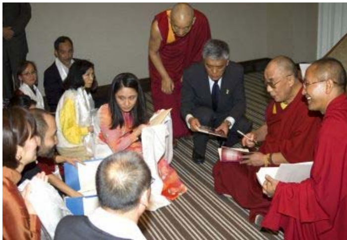
Presenting Gifts and Signing Books

Forty minutes with His Holiness went by quickly like a fragile dream! Before ending, a friend of Viet_Vajra Foundation asked if His Holiness foresees that he would be traveling to Vietnam in the near future to teach the Buddha-Dharma. His Holiness responded that he anxiously looks forward to visiting Vietnam when the situation becomes suitable. Similar to the situation in Vietnam, His Holiness said that Buddhists in Laos, Kampuchea, Thailand and Mongolia etc. are hopeful for an opportunity to welcome him, and he himself also cannot wait to visit these countries.