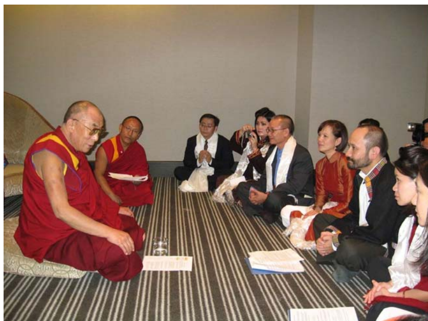
HHDLTM Sitting on a Small Cushion Giving Teaching

Being within such a close proximity to His Holiness, a deep sense of respect and dedication to him arose within each of us, and a few of us were moved to tears. Sitting cross-legged on the floor with the sandals underneath his maroon robe, and sharing this cozy room with us, this holy man made us feel as if we were embracing a beloved father who has just returned home after a long absence. The absence seems like it never happened while we were comforted by His Holiness's boundless love and compassion.