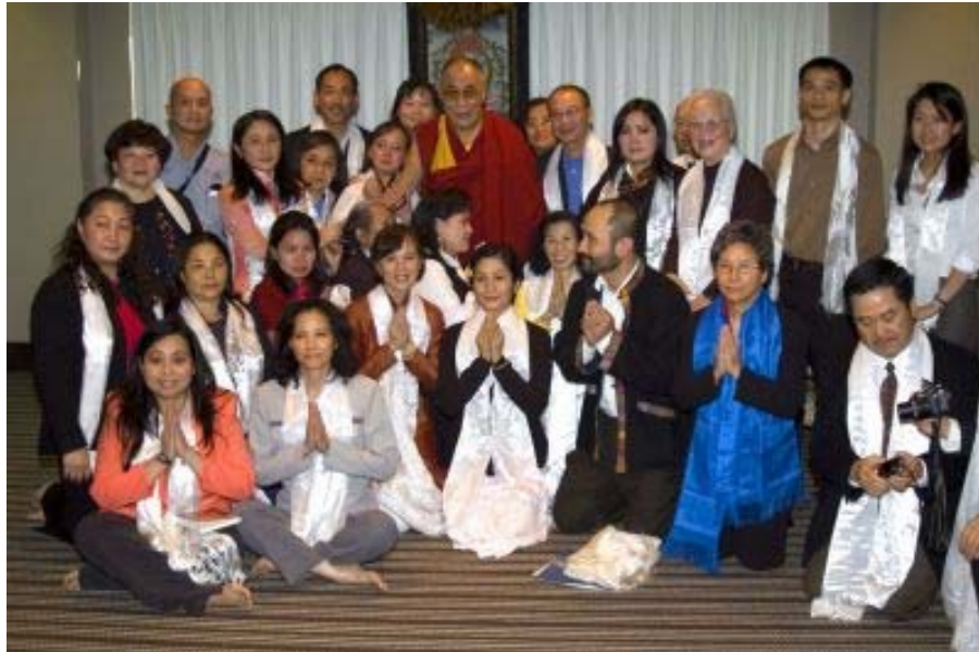
Viet_Vajra Foundation Group Photo with HHDL M

sister has been in charge of the administration, education and caring of the Tibetan orphans, who lost their parents during the escape from Tibet.