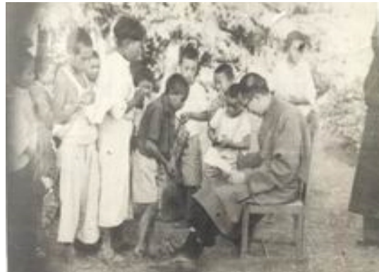
HHDLTM at the Tibetan Children's Village (1960)

The audience with His Holiness finally came to an end, and together, we chanted His Holiness' four personal favorite verses by the great Shantideva. These beautiful verses were engraved on a plaque dedicated to him. We also presented His Holiness with the monetary offering for the Tibetan Children's Village ( www.tcv.org.in ) - a non-profit organization devoted to educating Tibetan children in India. After His Holiness the Dalai Lama went into exile in India in 1959, he established this village. Since then, his own