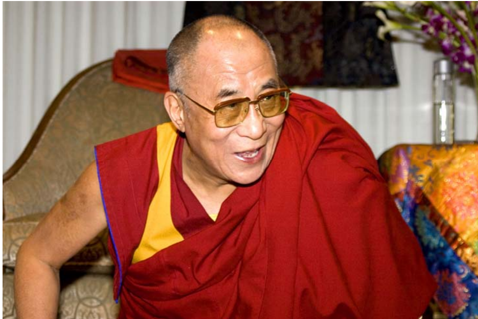
His Holiness 14 th Dalai Lama Smiling at Audience